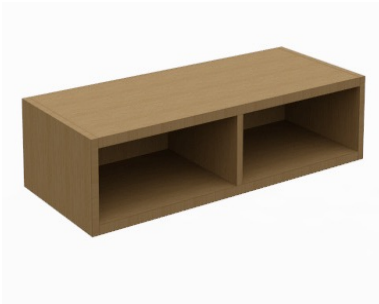
Option 3 Steelcase Universal